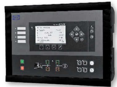
Advanced Genset Controller, AGC 200