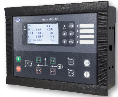
Automatic Genset Controller, AGC 100